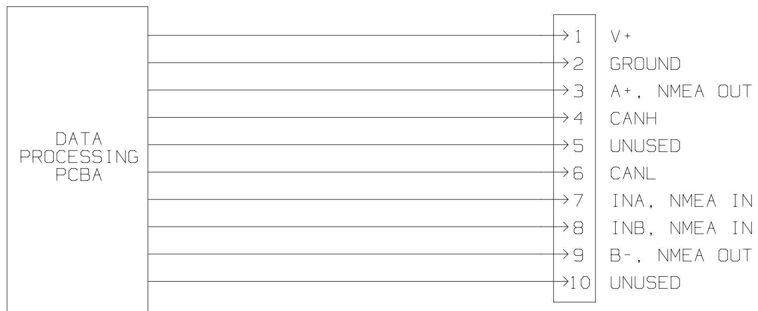
SOLDER LUG VIEW